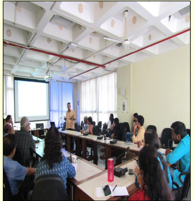
Students with faculty members and office staffs