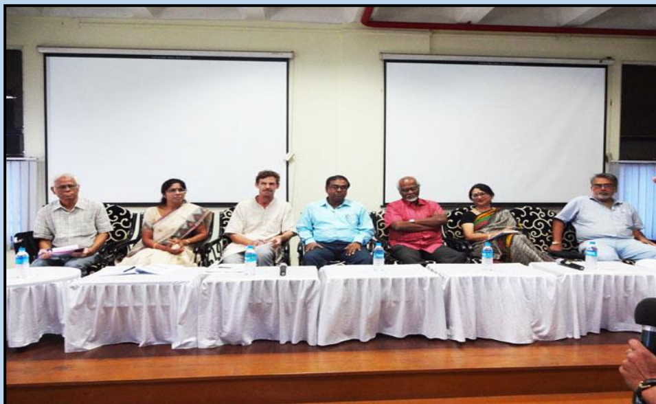
Lectures, panel discussions, workshops at IDSK