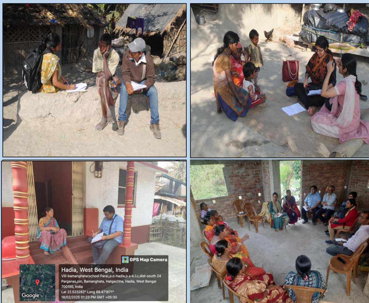
Interviews and FGDs during field surveys by IDSK students